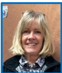
Susan Lucci Handicap Chair